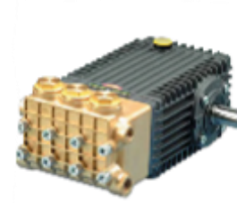
High pressure 350 bar water pump