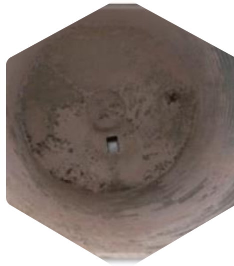
Dirty, contaminated silo