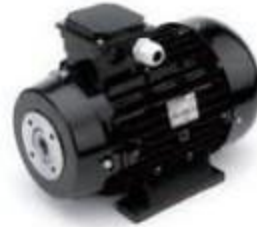
Powerfull double flange motor 11 kW, specially designed for water jetting pumps