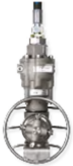
Self propelling orbital rotating high pressure cleaning head