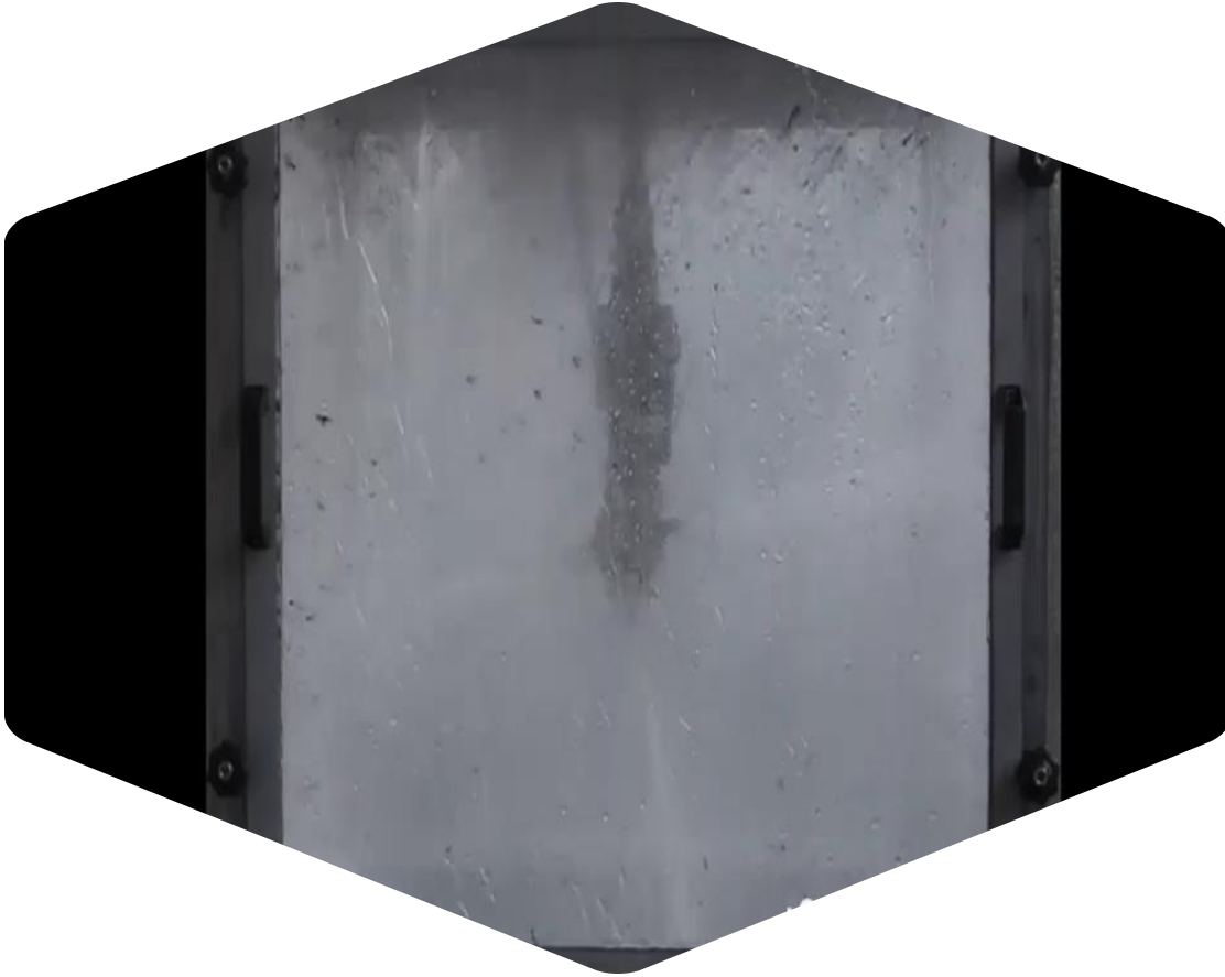
The core technology

High pressure orbital self rotating water jetting head