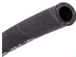
Flexible 1/2" hydraulic hose