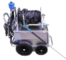
Robust stainless steel and hot dip galvanized charriot