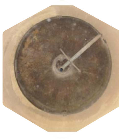
Dirty, contaminated silo