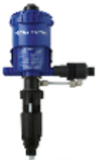
Water powered metering pump and water filter unit for accurate dosing of chemicals