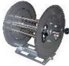
Stainless Steel hose reel, with reel brake and swivel joint