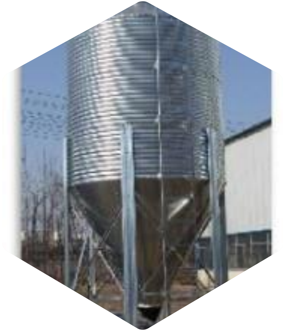
Corrugated steel farm silo