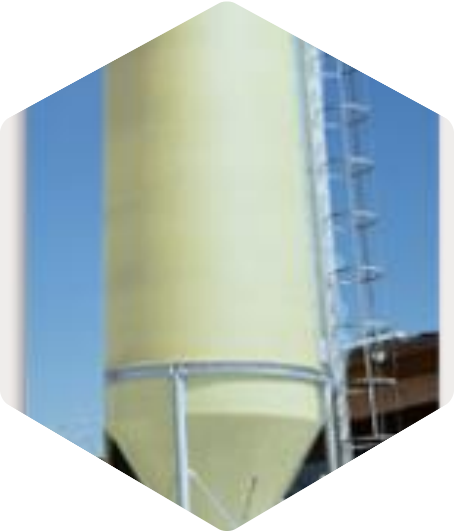
Fiberglass farm silo