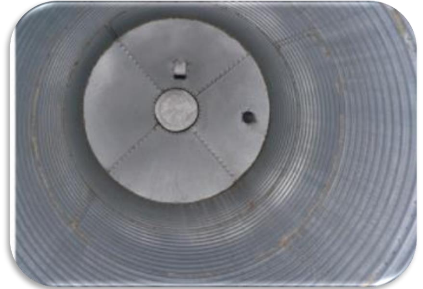
✓ After YourSiloCleaning