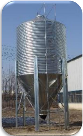
Corrugated steel farm silo