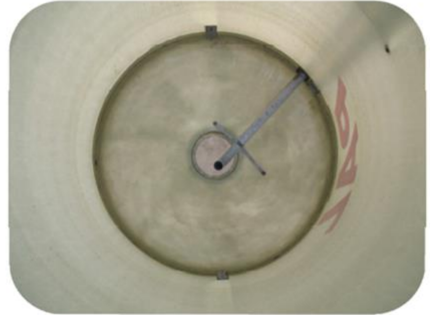
✓ After YourSiloCleaning