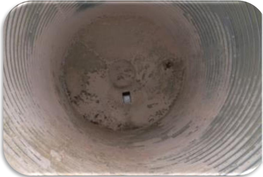
✓ Dirty, contaminated silo