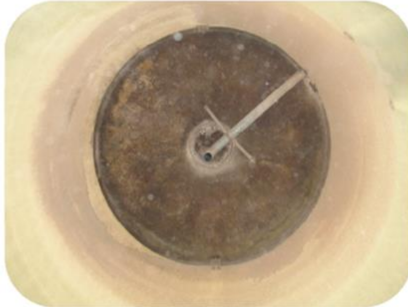
✓ Dirty, contaminated silo