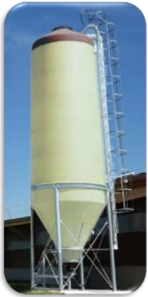
Fiberglass farm silo